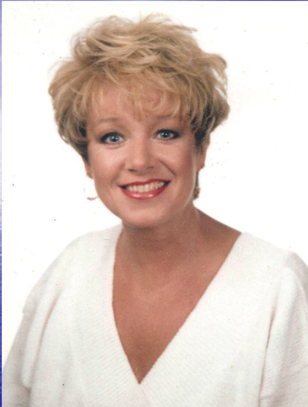
Estée Lauder Representative, Fort Lewis, Washington - 1994