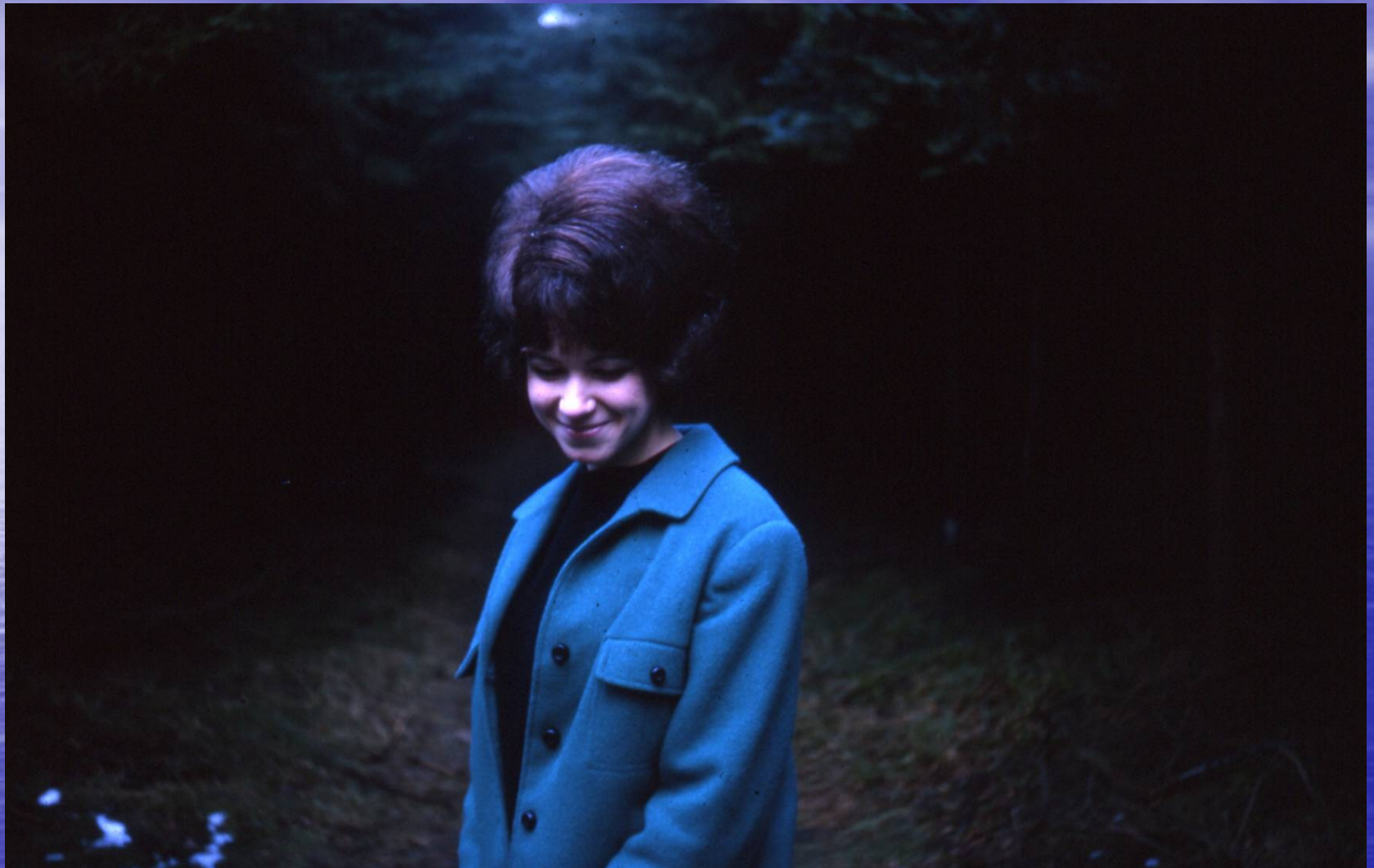
First photo - Schwarzwald near Pforzheim, winter 1964