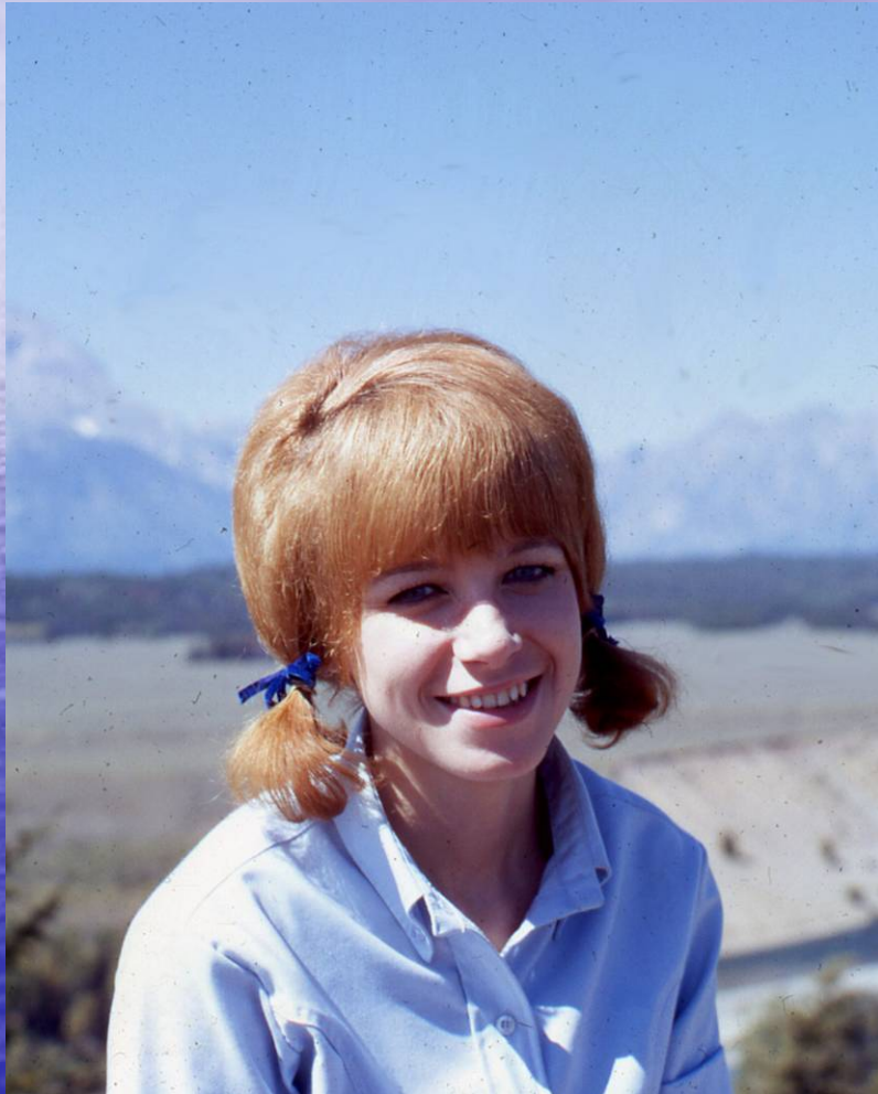
Grand Tetons, Wyoming