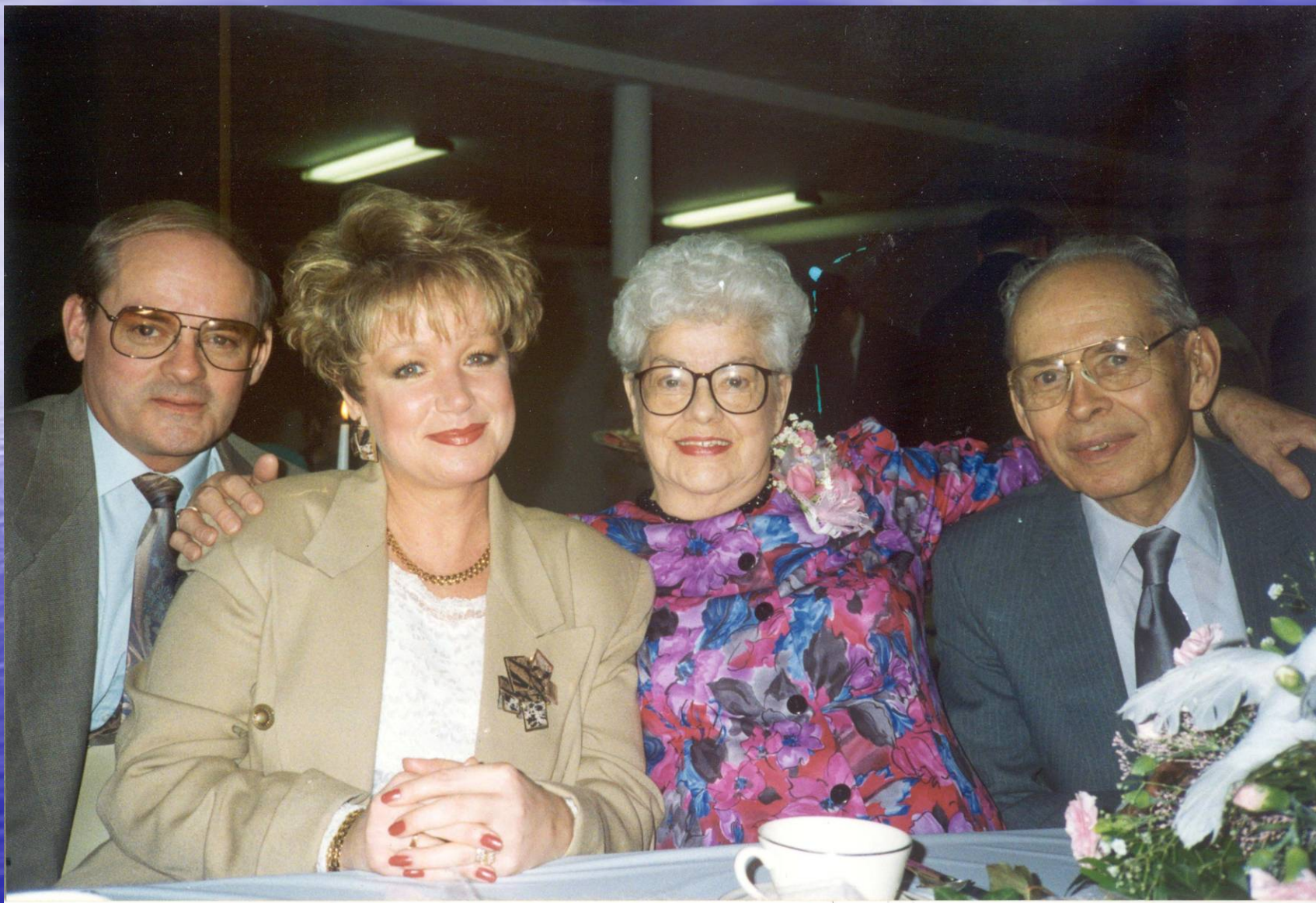
Last photo - with Buzz and Buzz's Mom and Dad - 1994